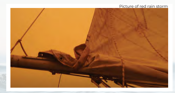
*Red Rain- This is where relatively high concentrations of red coloured dust or particles get mixed into rain, giving it a red appearance as it falls.

MSUV Clear has a semi gloss apperance, silimiar to a satin paint in finish.